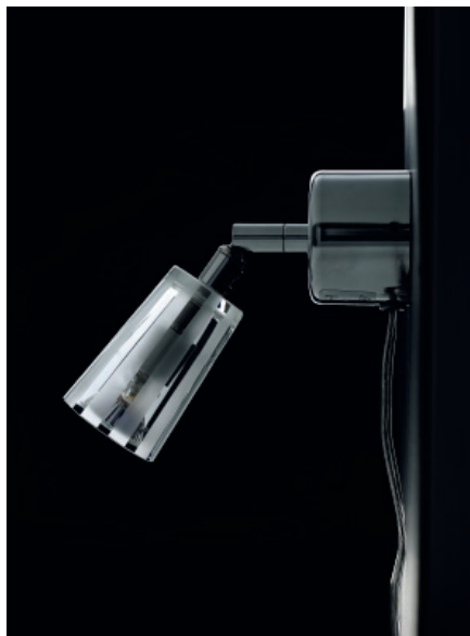
Wall lamp 8 vertical stripes