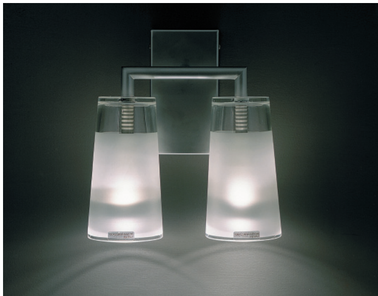
Wall lamp 2*16

Wall lamp in clear glass, with a frosted horizontal band or with frosted vertical stripes. Elegant details in stainless steel, chrome and aluminium.